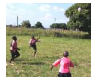
Bovs at Lukodi Primarv School honing their Aussie Rules skills. (See if you can spot the footy!)

".. they want for their children what we all want for ours opportunity and a future ..."