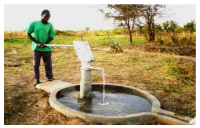
Newly installed water pump at Loyo Boo.

One of the critical needs was for a clean water source and thanks to a Bright Futures donor a new well was installed. The children of the village, together with hundreds of others from the area, are being assisted by Bright Futures in their schooling aided in maintaining schooling through a nutrition program and teacher support.